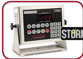
200 Series Weight Indicators