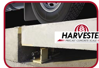
Harvester® Precast Concrete Truck Scales

Cardinal Scale reserves the right to improve, enhance or modify features and specifications without prior notice. All registered trademarks are the property of their respective owners.