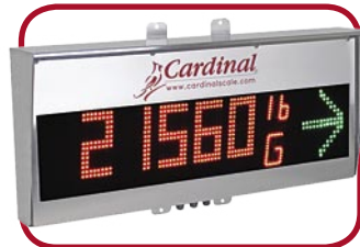
Large Readout Remote Displays